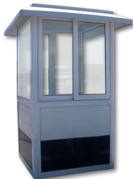
Sentry box mod. 90