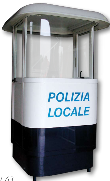
Sentry box mod. 63