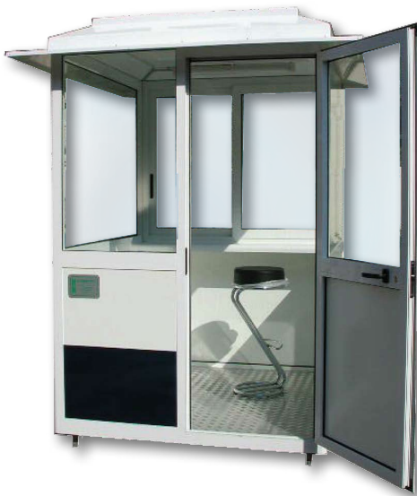
Sentry box mod. 90/L